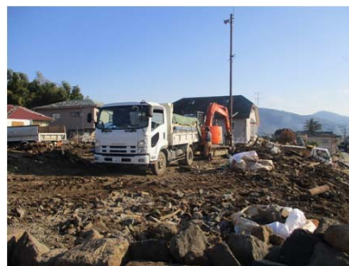
Photo: Mashiki Town removal of the collapsed houses underway .