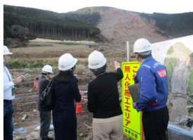
Photo: Collapsed slope

Participants from 23 ADRC member countries visited the collapsed Aso Bridge area. Emergency works have been undertaken since May 5 th , 2016 including earthworks and building of mounds, slope protection works by using construction machines for automatic operation, due to the cracks as well as unstable earth and sand left at the top of the slope.