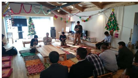
Photo: Community center located at Techno Temporary housing complex.

ADRC study visit participants discussed Mashiki town officials evacuation and organisation of temporary housing complex towards immediate recovery for affected residents.